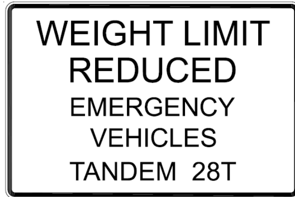
DIVISION STREET SIGN