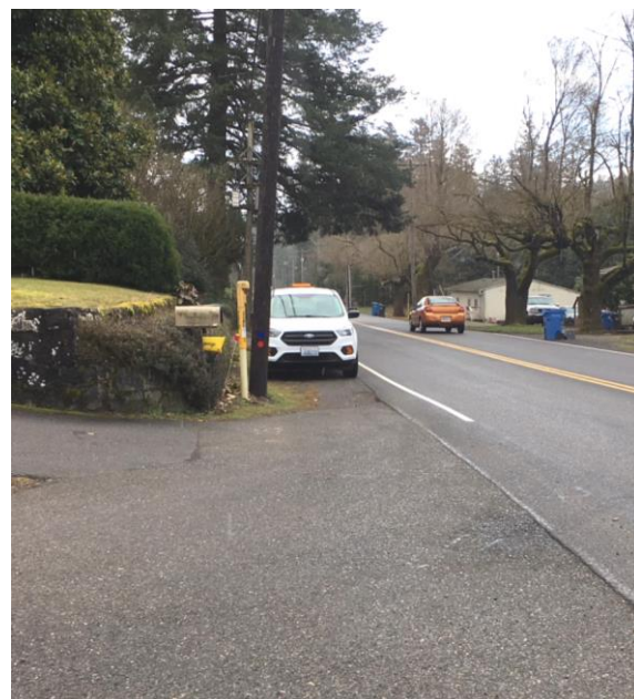
Figure 2: Sight distance from NE 39th Avenue looking south.