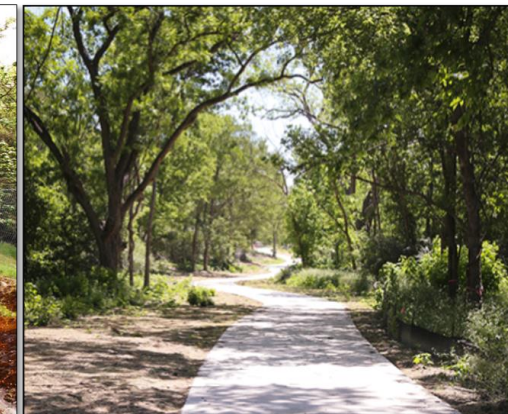
Mill Ditch vision