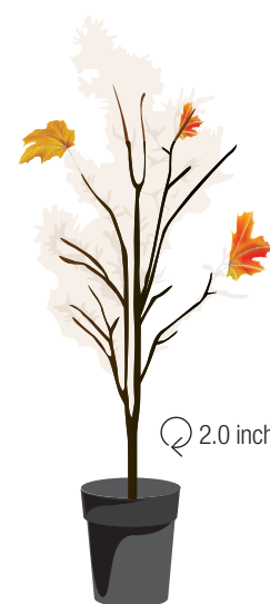
DECIDUOUS: 2.0 inch caliper, branched 2.0 inch DBH