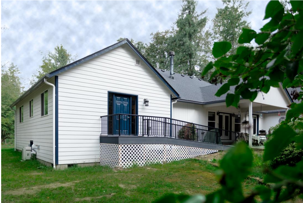
House on Remodeled Homes Tour