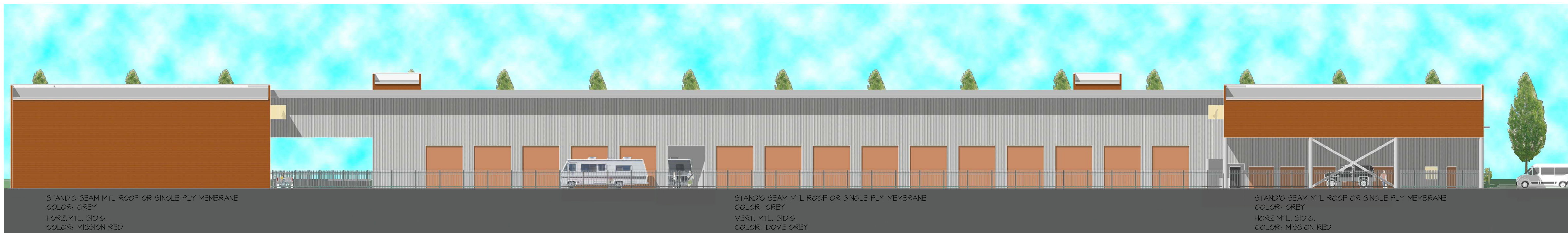
4 CONCEPTUAL EAST ELEVATION SCALE: 1/16" = 1'-0"