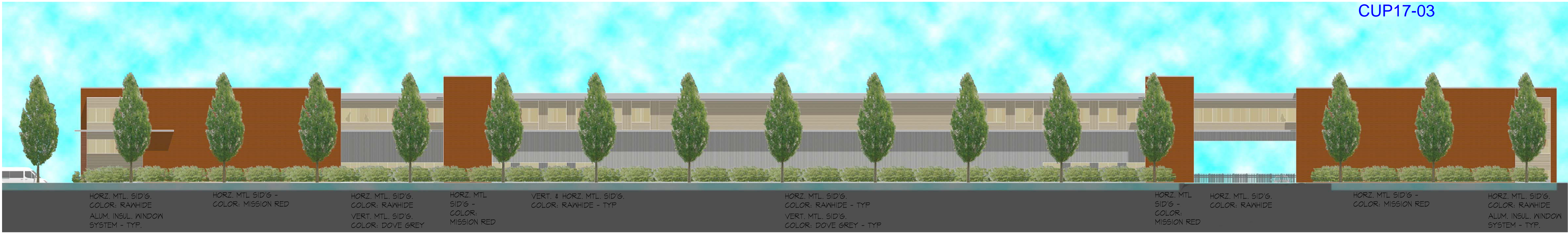
1 CONCEPTUAL WEST ELEVATION SCALE: 1/16" = 1'-0"

UNION STORAGE NW Friberg-Strunk St. Camas, Washington