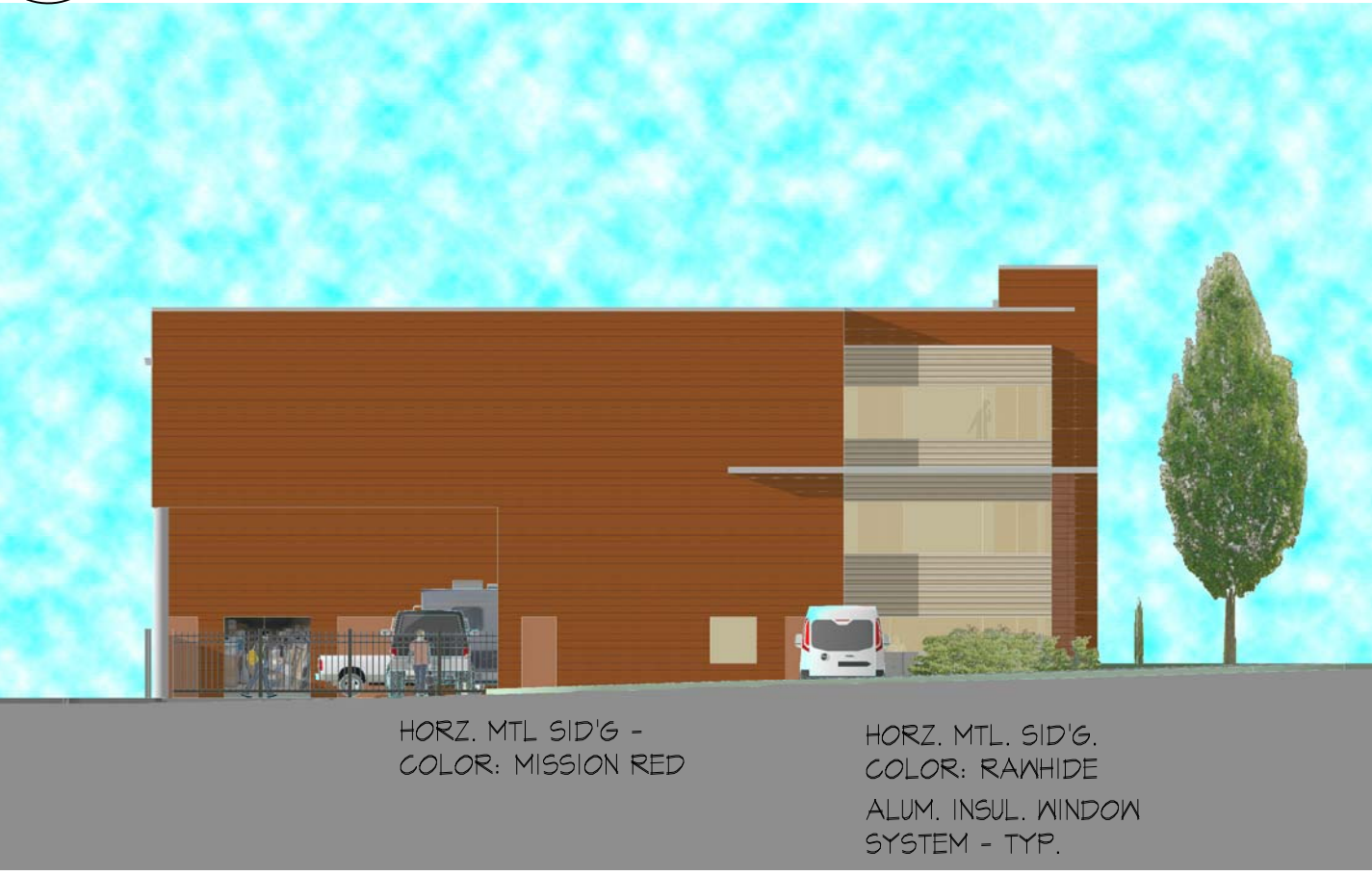
2 CONCEPTUAL NORTH ELEVATION SCALE: 1/16" = 1'-0"