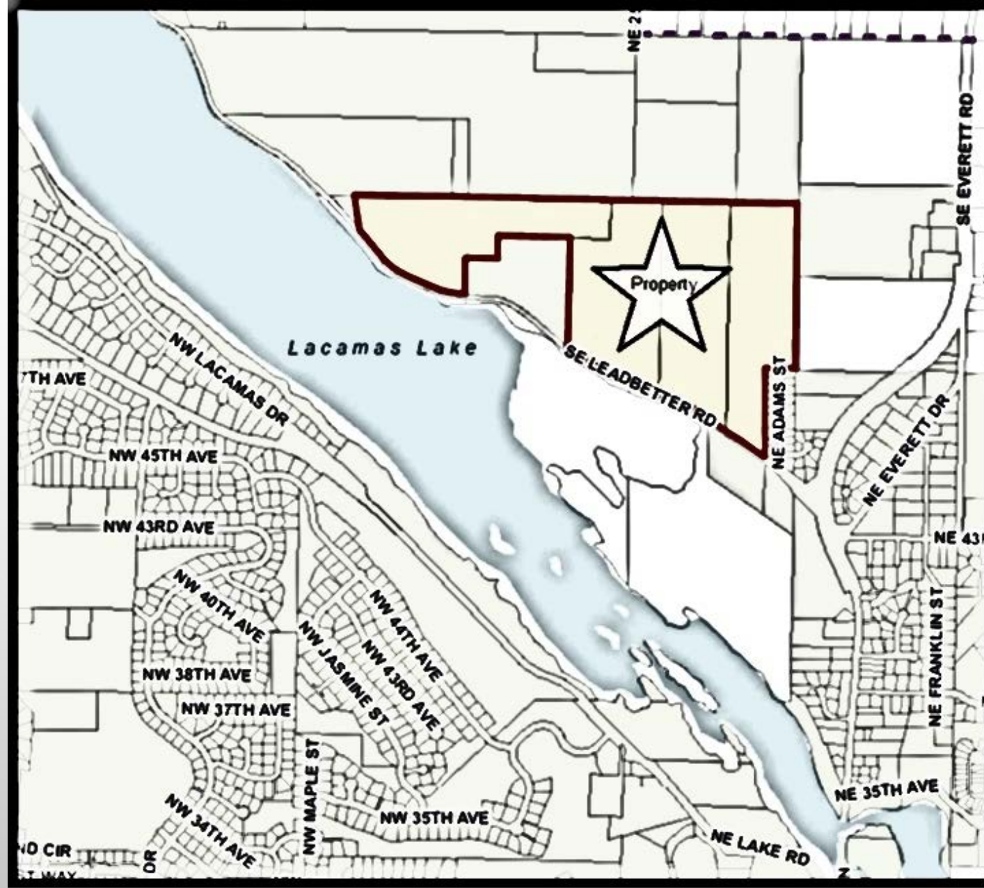
Location of Future Subdivision ("CJ Dens")