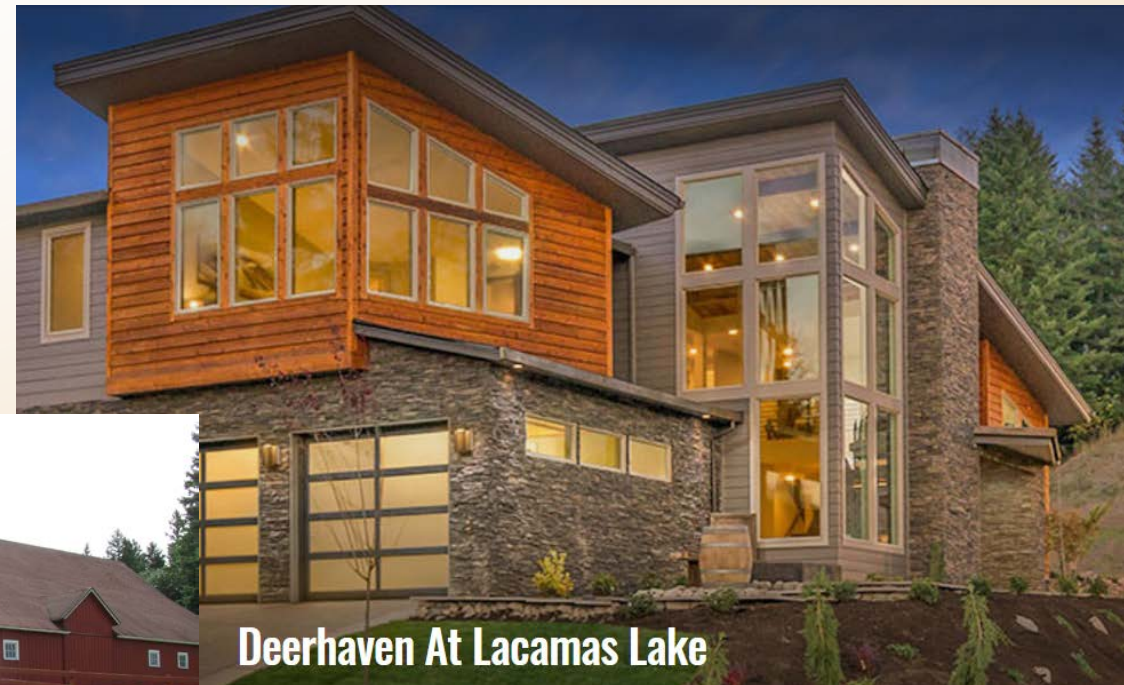
Deerhaven At Lacamas Lake