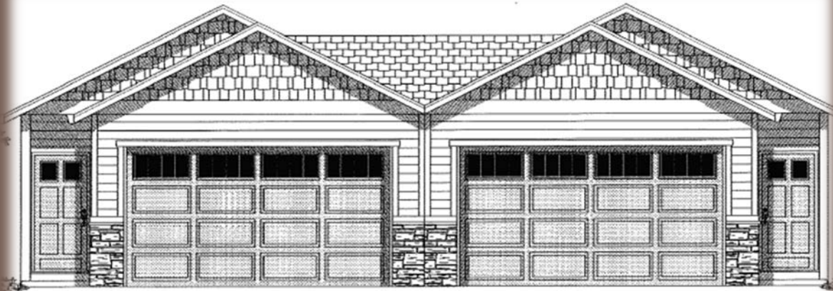
FRONT ELEVATION A SCALE 1/4"=1'-0"