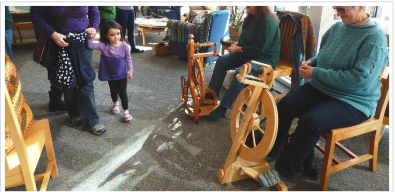
Fiber to Fabric February 2017