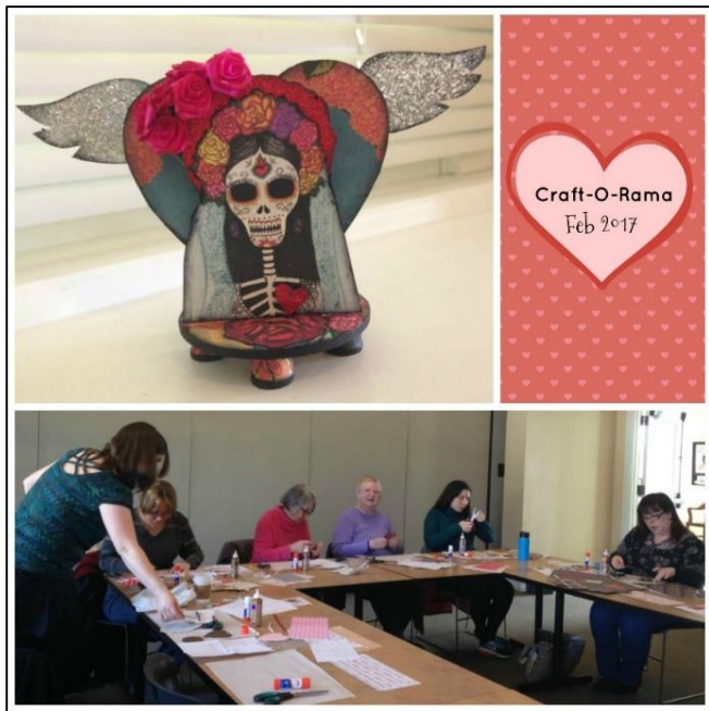
Craft-O-Rama Feb 2017