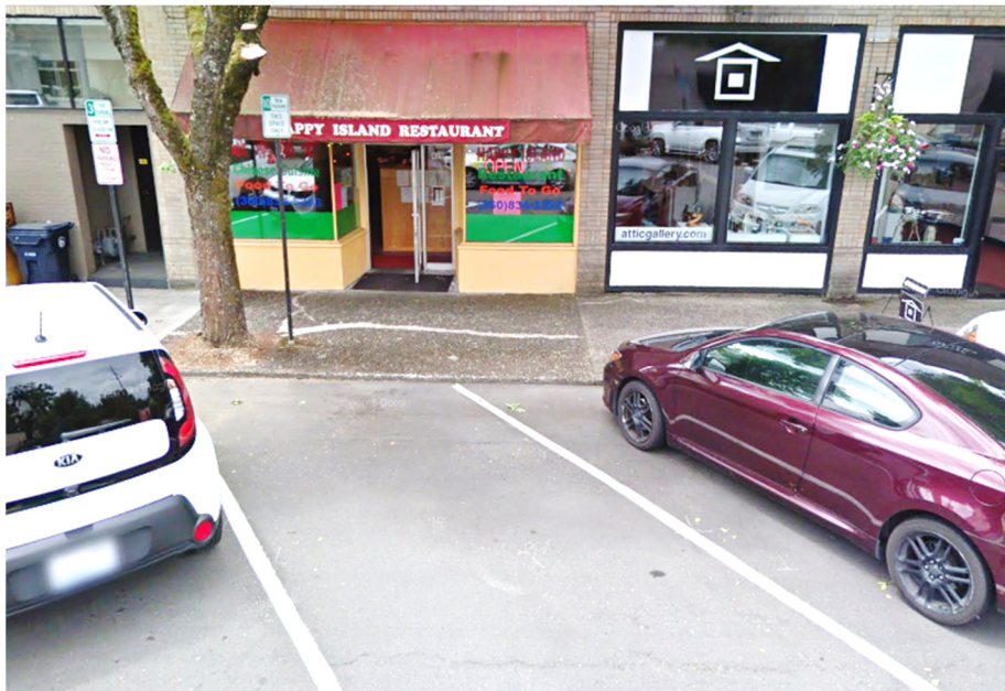
Existing 10-minute parking spot in front of the expired Happy Island restaurant.

ACTION REQUEST: Staff requests that the Parking Advisory Committee review this situation and provide a recommendation to Council.