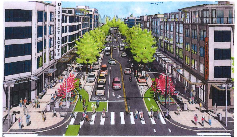
Redmond 152 Avenue NE Complete Streets Plan

TIB will limit the number of nominations based on the number of eligible cities and counties, the amount of program funding, and the size of the nominating organization. TIB plans to invite the following state agencies and statewide non-profits to become nominating organizations: