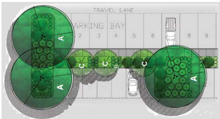
(New) Figure 18.13.060-1 Example of Parking Lot Planter Areas. In this example, there are three medium-sized trees ("A") for 18 parking spaces, with ground cover ("B") and shrubs ("C").