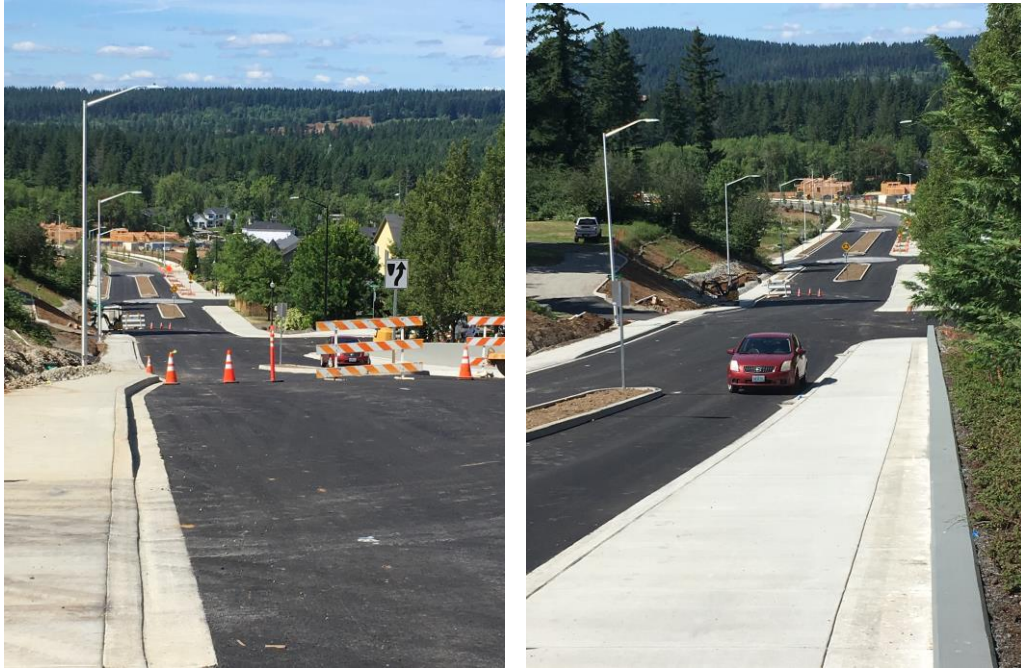
Figure 2: Larkspur Street Improvements Looking North Toward Camas Meadows Drive