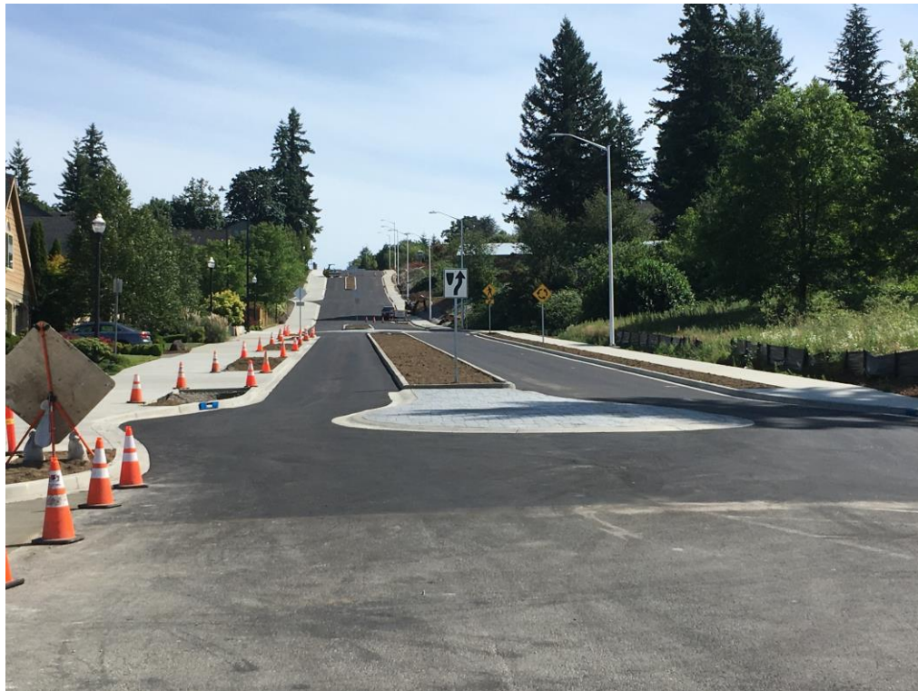
Figure 3: Camas Meadows Drive Looking South at the Larkspur Street Capital Improvements

RECOMMENDATION: At this point in time, staff is seeking consensus from Council regarding opening NW Camas Meadows Drive/Larkspur Street to through traffic upon substantial completion of the City's capital project.